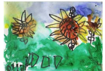
Garden art from the Morse School kindergarten