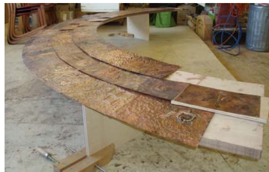
Student-designed copper panels grace the King Open's garden bench.

Chinese characters and create images and words that they 'hammer' onto copper panels.