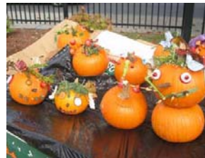
Mr. Pumpkin and his family.

Mark your calendars for the 7th Annual Harvest Festival this fall, October 13, 2007 at the M.L. King/Amigos Schools.