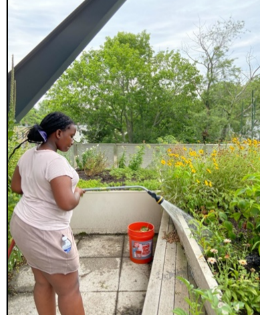
Caring for the rooftop garden at the MLK School

The Young Leaders Program is now the CitySprouts Green Team! Thanks to feedback from several community stakeholders, this name change reflects our commitment to inspiring middle schoolers through gardening with their peers, building leadership and connecting them to the multitude of community organizations and green spaces throughout Boston and Cambridge.